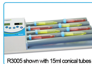
R3005 shown with 15ml conical tubes