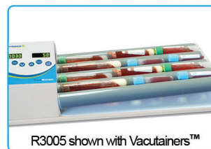
R3005 shown with Vacutainers™