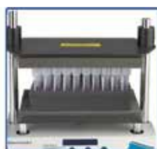
50 x 5 or 7ml