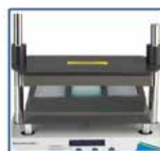
3 x microplates