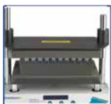
50 x 1.5/2.0ml