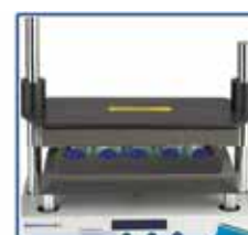
9 x 50ml Horizontal QuEChERS