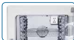
Internal power outlet