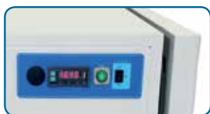
SureCheck data logging port