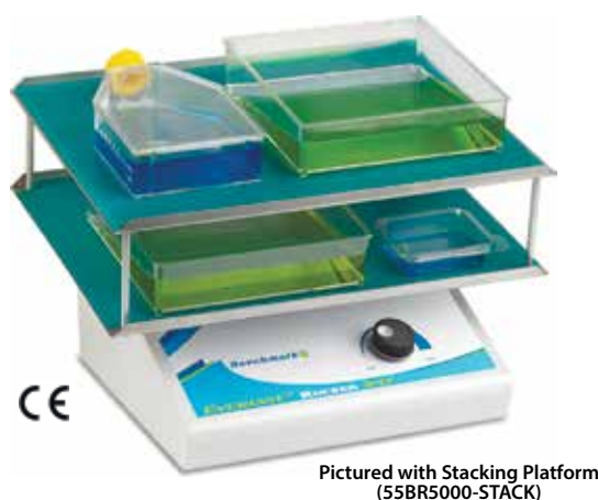
Pictured with Stacking Platform (55BR5000-STACK)