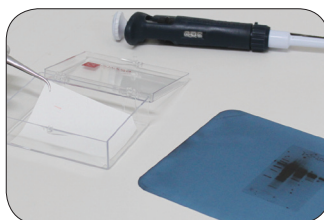
Beautiful Western blots every time