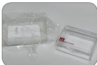
Save antibody and buffer by using the smallest tray that can hold your blot