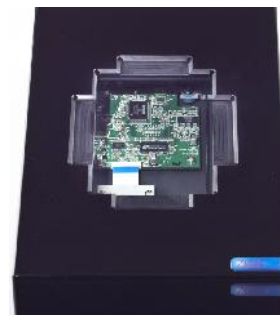
Scanner with Cryoprotection™