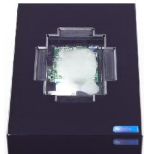
Scanner without Cryoprotection™