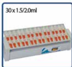
30 x 1.5/2.0ml