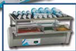
55BR1000-E with 55BR1000-STACK