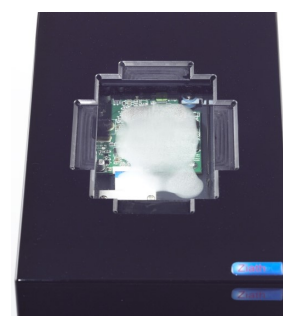
Scanner without Cryoprotection™