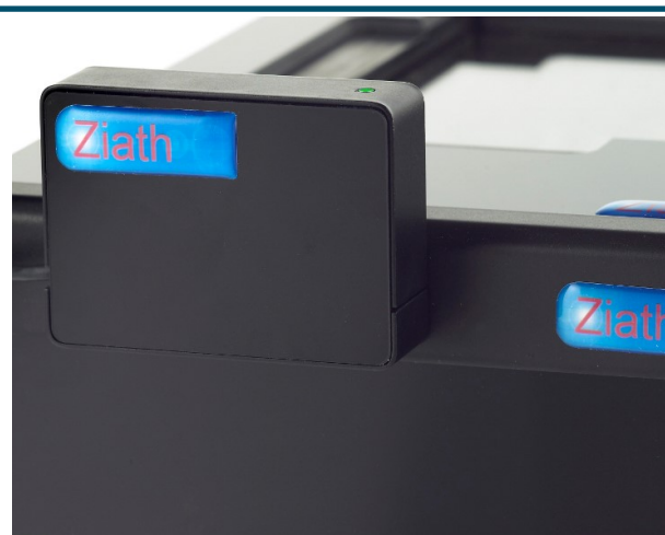
The new Linear Barcode Rack Scanner is easy to install and use