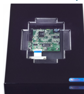
Scanner with Cryoprotection™