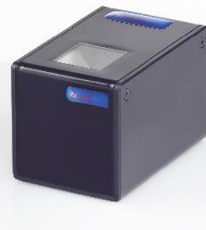
DataPaq Single Tube Scanner with Cryoprotection™. No condensation has formed