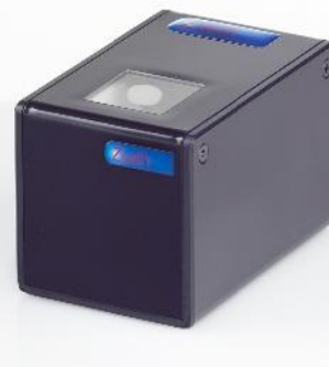
DataPaq Single Tube Scanner without Cryoprotection™. After repeated scanning, condensation starts to appear