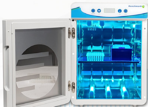
6-bulb design with UV-C transparent shelf for 360° exposure