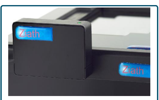
The DataPaq<sup>™</sup> Linear Barcode Rack Scanner is easy to install and use.

The occurrence of condensation whilst scanning tubes straight from cryogenic storage is well known. Ziath's cryoprotective coating eliminates the occurrence and ensures uninterrupted scanning. As Ziath's method for eliminating condensation uses no extra electrical components reliability is increased and costs are significantly decreased.