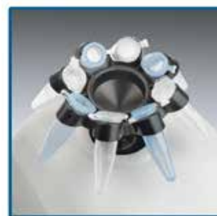
Unique Multi-Head allows for standard vortexing, PLUS holds up to 8 microtubes

The Mortexer™ is MORE than your standard vortex mixer. The unique design of the Multi-Head™ (included) features a traditional cup head for general purpose mixing, plus holds up to eight microcentrifuge tubes. The drive system is balanced with Q-Drive™ technology, providing a smooth vortexing action, while minimizing noise and excessive vibration. This results in quieter, more efficient and longer lasting operation.