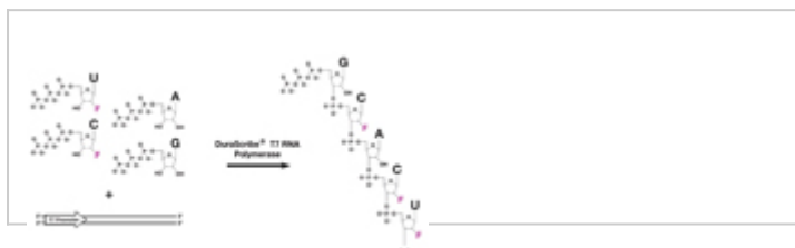
Figure 1 (click to enlarge). The DuraScribe® T7 RNA Polymerase efficiently incorporates 2'-F-dCTP and 2'-F-dUTP into full-length DuraScript® RNA. The presence of the fluorine at the 2'-position of the 2'-F-dC and 2'-F-dU nucleotides prevents digestion by RNase A.